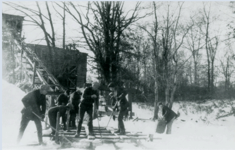
20 th century ice harvesting in Rehoboth.