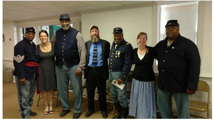
Following a graveside memorial service, a reception was held in the Tilton Room at the Carpenter Museum in September.